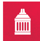
USED WITH DRILL CHUCK